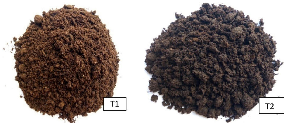
Plate 1 Compost samples from the resultant composts

Organic carbon content of the final compost was significantly affected by the treatments used in the study. Organic carbon content in T1 was significantly lower than that of T0 and T2 ( p=0.001 ). A huge reduction in the organic carbon from the initial carbon is seen in the C:N ratios. The C:N ratio values of the final composts were lower than those in the feedstock. However, the differences were not statistically significant at 5% (Table 1). Treatment T0 produced compost with the highest C:N ratio while treatment T1 produced compost with the lowest C:N ratio (Table 2). C:N ratio values of the composts produced by the treatments of this study were all within the recommended range of between 10 and 18 except in the control (T0). High C:N ratio in compost indicates the presence of unutilized complex nitrogen and